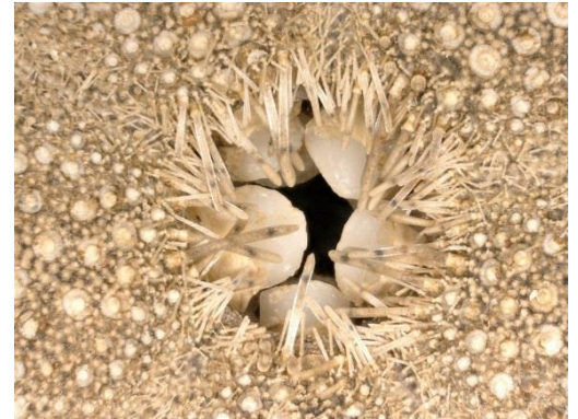
Photograph of the teeth of a sea urchin taken with a 3D microscope, which you can see at the museum as part of Zoom-in